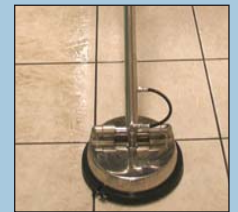
Tile Before / After