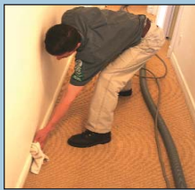
Wipe your baseboards