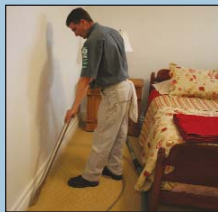
Clean your edges first with a special tool!