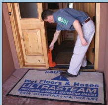
Protect your home with mats and corner guards