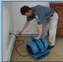
Speed-dry your carpet to get your home back to normal fast!